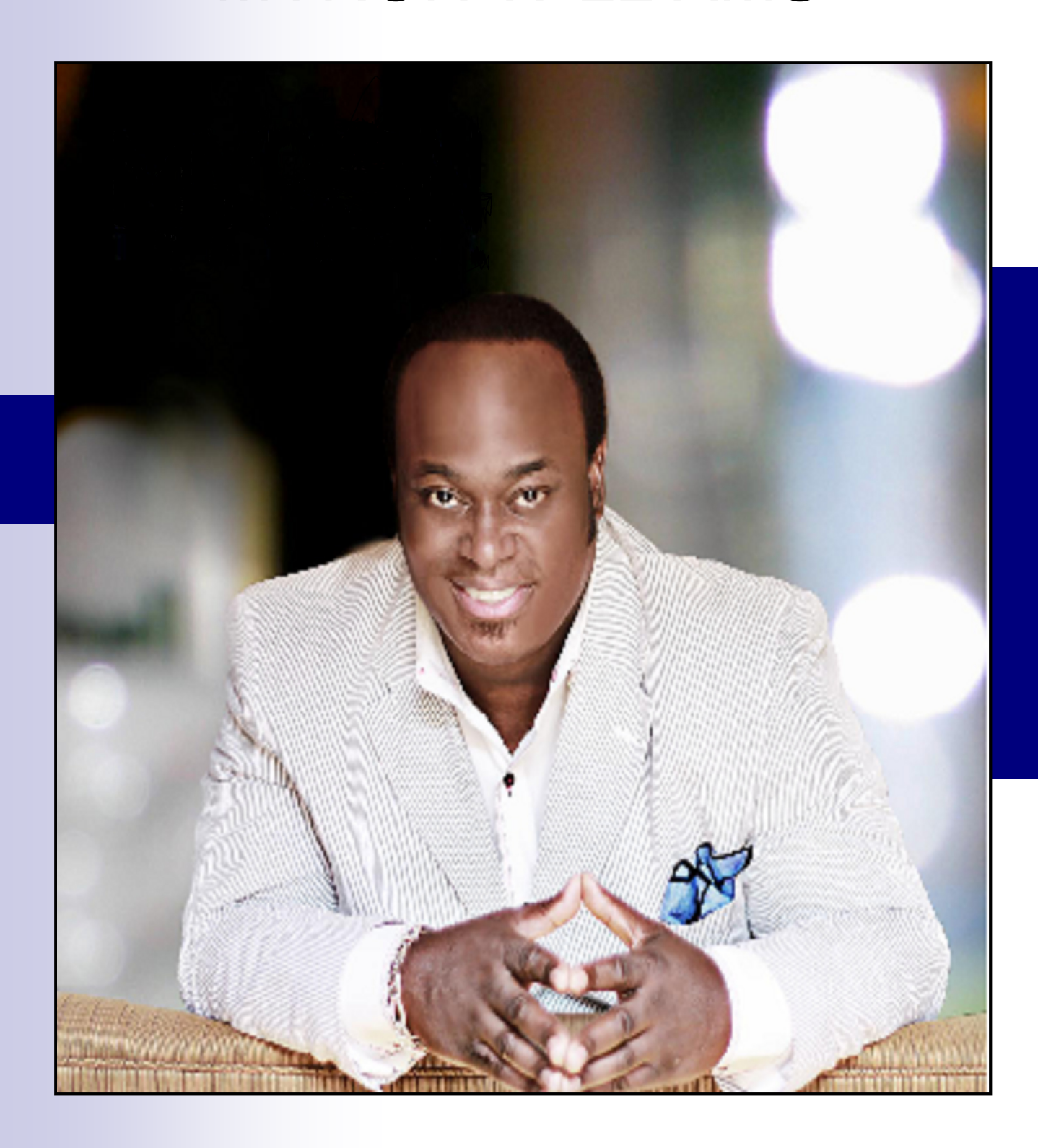
Producer | Writer | Recording Artist